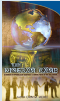
"Thy Kingdom Come" A Church of unparalleled greatness is coming forth in this millenium