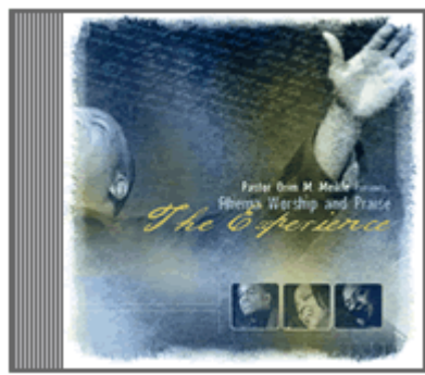
"The Experience" CD

Sample CDs then Order on-line the convenient way at eShop!