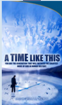
"A Time Like This" You are the generation that will witness the greatest move of God in human history