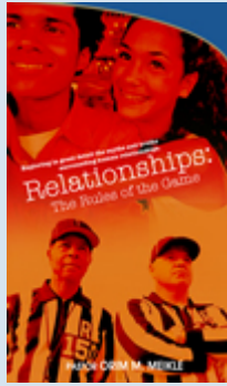
Relationships: most people are either in one or searching for one.